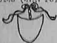
Plain shield hanging from true lovers' knot